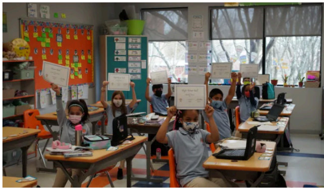
Thomas Edison EnergySmart Charter School held a virtual awards ceremony on Wednesday, Nov. 18.

TEECS accepts students from area school districts including Franklin, North Brunswick and South Brunswick.