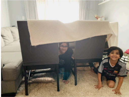
Wednesday, March 25, was Fort Day where students were encouraged to build a fort inside or outside.

Thursday, March 26, was Teacher Shout Outs where students were encouraged to make signs or record a message to their favorite teacher.