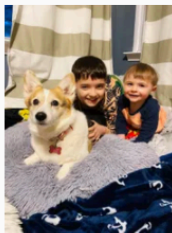
Monday, March 23, was Pet Day where students were encouraged to play with their real or stuffed animals.

Last week, in an effort to add some fun to our time at home, Thomas Edison EnergySmart Charter School in Somerset added a little school spirit to keep everyone's spirits up. Each day students and parents uploaded photos of themselves enjoying the theme and those photos were posted and shared on Facebook.