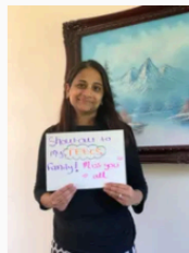
Thursday, March 26, was Teacher Shout Outs, where students were encouraged to make signs or record a message to their favorite teacher.

Monday, March 23, was Pet Day where students were encouraged to play with their real or stuffed animals.