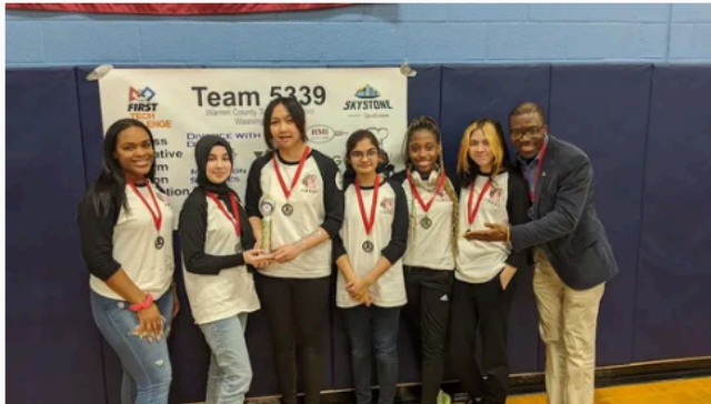
TEECS Girls Robotics team dominates.

CONNECT | TWEET | LINKEDIN | COMMENT | EMAIL | MORE