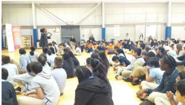
TEECs celebrated Black History Month

Also: Thomas Edison EnergySmart Charter School celebrated Black History Month with special assemblies for all grades.